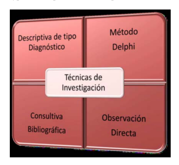
Fig.1. scheme of the techniques used methodology.

The research aims to develop a system of measurement of the impact of the industry in the society of the locality of Engativá in Bogotá D.C.Taking into account the methodology used in this research is qualitative type of deductive type - descriptive, the techniques used are: