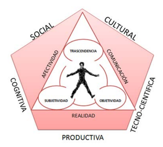
Fig.2. graphic dimensions be human source group Smiis

By focusing on the identification of the dimensions, arises the need for a tool that allows